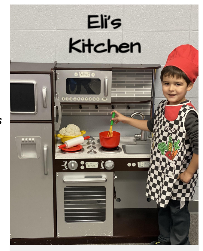
Happy Thanksgiving 2021

Where will you celebrate Thanksgiving? At my dad's house.