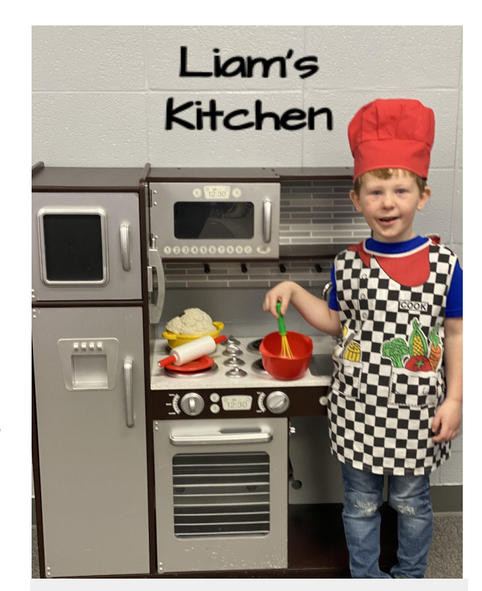
Happy Thanksgiving 2021

How many people will be at Thanksgiving with you? My mom and dad and brothers and my one sister.