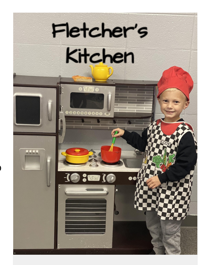
Happy Thanksgiving 2021

How many people will be at Thanksgiving with you? Me, my brother and sister. Maybe my mom, dad and my dog named Patch.