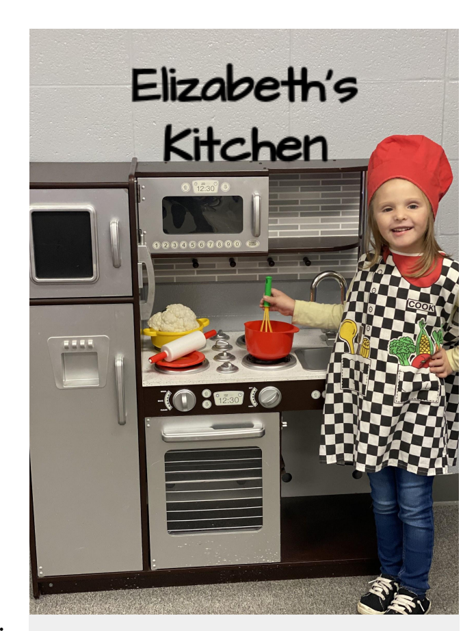
Happy Thanksgiving 2021

How many people will be at Thanksgiving with you? My dad and papa and nanna.