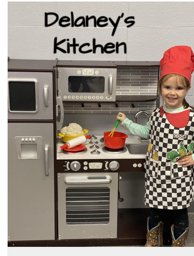
Happy Thanksgiving 2021

What else do you eat on Thanksgiving? I will eat raccoon, squirrel, and some rabbit and some strawberry and pumpkin pie.