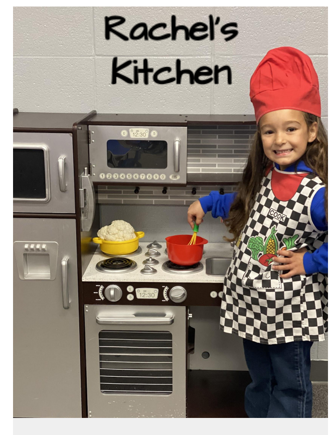
Happy Thanksgiving 2021

Where will you celebrate Thanksgiving? We are going to Grandpa's house.